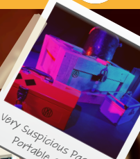
A Very Suspicious Package - Portable Game!