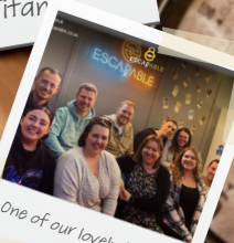
One of our lovely teams!