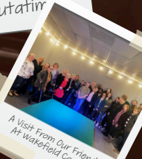
A Visit From Our Friends At Wakefield Council