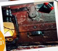
Avast - Portable Game